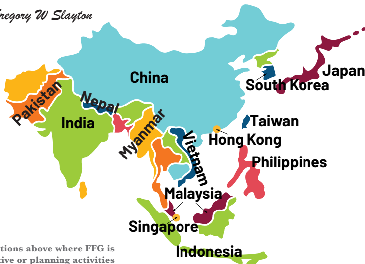
Nations above where FFG is active or planning activities