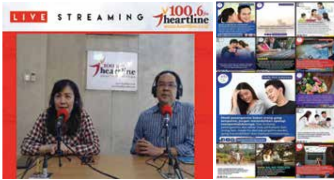
FFI's Social Media and TV/Radio Programs have blessed millions of families in the world's largest Muslim nation.

FFI also spread hope using their Instagram accounts, @familyfirstindonesia and @hatiyygembira (which means joyful heart), that now have over 170,000 followers. Other FFI programs, such as the Amazing Grace Project, have blessed many thousands of Indonesian families.