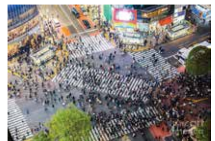
Shibuya Crossing, Tokyo, Japan Less than 1/2 of 1% of Japanese people consider themselves Christians