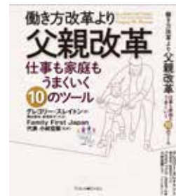
FFJ launched an excellent translation of "Be A Better Dad Today" in 2020 which has won much praise.

2022 will be a critical year for FFJ as they grow their family service programs. Please pray for them to further serve and bless thousands of Japanese families in the coming years.