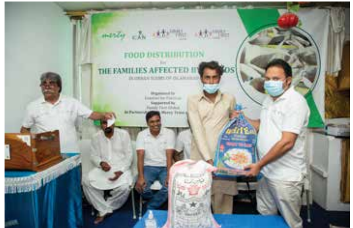
Members of FF Pakistan distribute badly needed foodstuffs to poor families hit by monsoon flooding this past summer

FF Pakistan was established in 2020 and came on strong this year. In 2021 their Board of Directors obtained Gov’t of Pakistan recognition as a Not-For-Profit, began their service programs to Pakistani families and established a solid working infrastructure. Operationally FFPak focuses on a “Train the Trainers” strategy that multiplies impact all over Pakistan. They also completed a high-quality Urdu translation of “Be a Better Dad Today.”. 100% of revenues benefit FFPak. FFPak is also leading an Amazing Grace Project that will launch at Christmas. The goal is to benefit over 30,000 Pakistani children and their families. And when disastrous flooding hit the poorest neighborhoods in Pakistan’s capital city of Islamabad this summer, FFPak responded with care packages of food and clothing to bless families in desperate need.